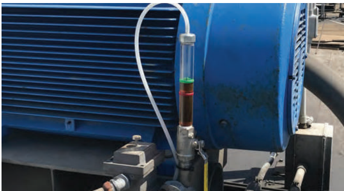
Vent Tube Option - Cooling Tower

The Column is a 3D sight glass designed for monitoring of fluids with greater fluctuations in level. The Column can be installed at the drain port or anywhere below the oil level. Included red and green level rings provide easy monitoring of the level between idle and running conditions. The level rings have a tamper-proof design to prevent accidental adjustments. The top of the Column includes either a 3-micron stainless breather or a vent tube kit for plumbing the air back to the headspace of the oil reservoir. The Column is made of the crystal-clear and chemically resistant Tritan™ material with 1" NPT threads for extra durability and also includes zinc-plated or stainless steel steel thread reducers. The Column works great with Luneta's Hub and Bowl. There is also a bypass tubing kit so the Column can be used in conjunction with a filter cart.