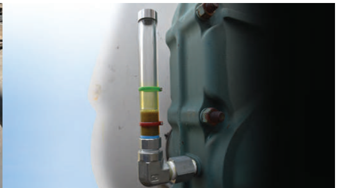
3-Micron Breather Option - Speed Reducer

Available Male Thread Size: NPT 3/8", 1/2", 3/4" and 1" Available Lengths: 3", 6", 9", 12", 15", 18", 24", 36", 48" and 60" (custom lengths are also available)