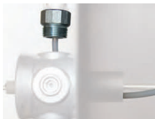
Bypass Tubing Kit BYPASS.COLUMN