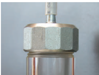
Vent Tube Kit VENT.COLUMN

VIMS GmbH Kaiserstraße 100, TPH III 52134 Herzogenrath, Germany +49 (0) 2407 953 858 0 info@vims.de www.vims.de