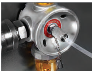
The Hub HUB.XXX