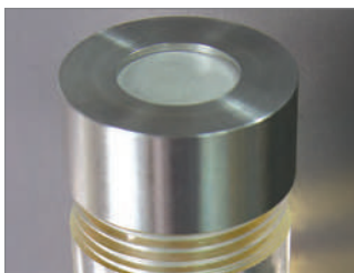
Breather 3-micron BREATHER.COLUMN